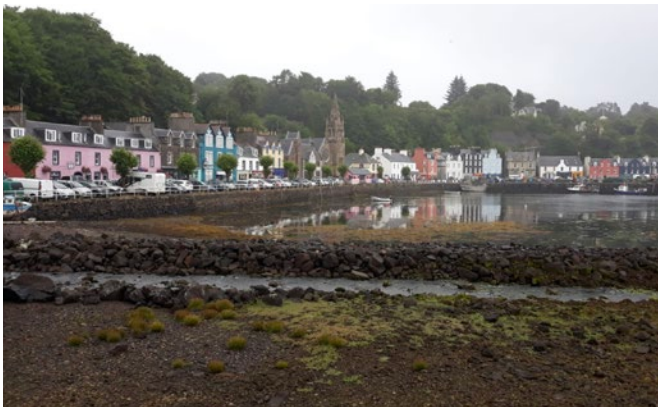
(Above) Tobermory, Mull