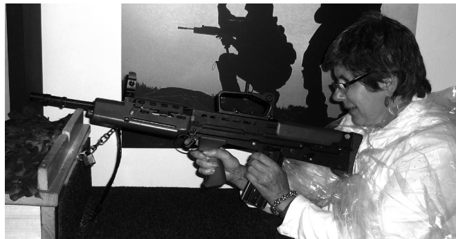
Gunning for scum: Newsletter Editor in anti-thief training with M16 assault rifle

the police have a good chance of getting the scumbags. Luckily, I arrived home before they had the chance to take much. However, they had gained entry by kicking down my front door in broad daylight in the middle of the afternoon which gives some measure of their resolve/desperation – and provided a really good footprint. I have to say the police were fantastic. They were here in seconds and I got to ride in a police car (with tinted glass) searching the area for the culprits.